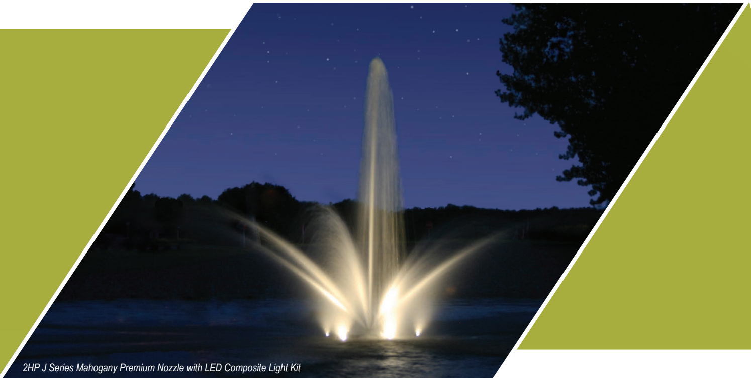
2HP J Series Mahogany Premium Nozzle with LED Composite Light Kit