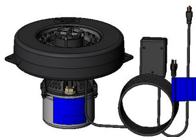
1400JFL With Lights

The motor unit attaches to the float using stainless steel hardware for a secure assembly. The single section, U.V. resistant, high density thermoplastic float allows for excellent durability with an attractive shape and low visibility. The rigid polypropylene fountain housing helps protect the unit from debris and reduce the likelihood of clogging.