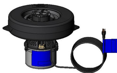
1400JF Without Lights

Assembly and Installation of Kasco equipment is quick and easy. Each unit includes an Owners Manual with specific steps to assemble, install, and operate the equipment properly.